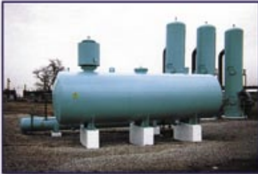
Gas Pipeline Suction Scrubber Sump Tank Vent Mist Extractor