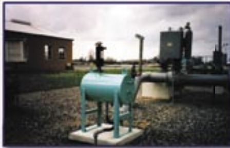
Multi-connection Gas Over Hydraulic Valve Actuator Vent Mist Extractor-15 Gallon Sump