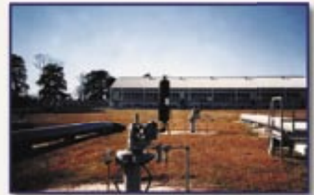
Valve Actuator Vent Mist Extractor - Removes 99.99% All Entrained Liquids 6 Microns and Larger