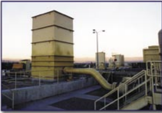
Gas Compressor Station Blowdown Separator/Silencer