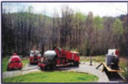
Gas Storage Well Unloader Blowback Separator - Designed To Free Flow 4" Side Valve, 3" Choke, 2" Top Valve, and 1" Siphon Drain. Unit Will Remove 99.8% All Entrained Liquid 6 Microns and Larger. System Design Employs Two Stages Of Separation Enabling the Device to Take Large Volumes of Liquid Slugs. Unit Design Incorporates 500 Gallon Liquid Holding Sump.