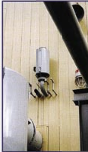
Compressor Rod Packing Vent Separator