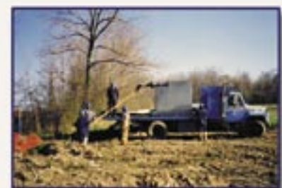
Portable Pipeline Blowdown Separator/Silencer