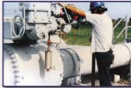
Gas Motor Operated Valve Operator With Vent Mist Extractor Removes 99.8% All Entrained Liquids 6 Microns and Larger