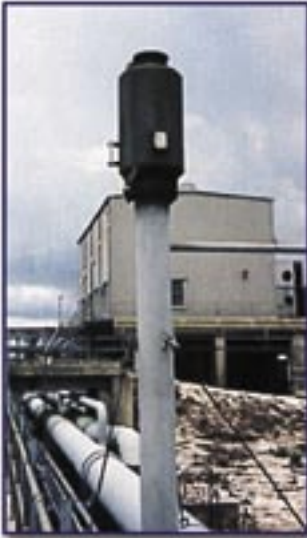
Solar Centaur Starting Gas Vent Separator