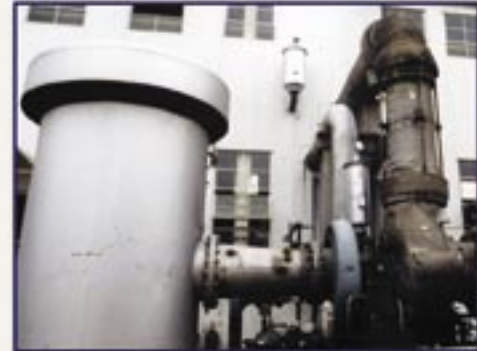
Reciprocating Engine Crank Case and Turbo Charger Case Vent Coalescer