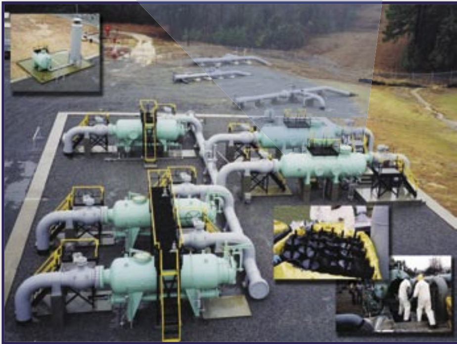
Model 119 KLS-2