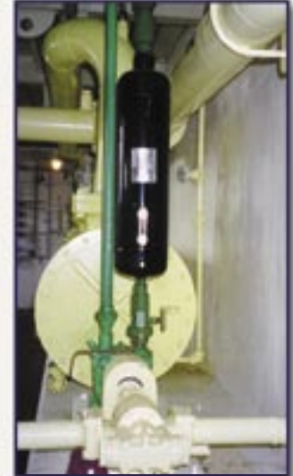
Gas Motor Operated Post and Pre-lube Pump Vent Separator