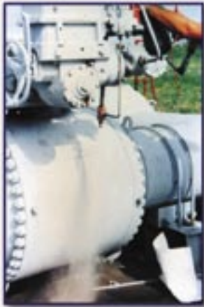
Gas Motor Operated Valve Operator Without Vent Mist Extractor