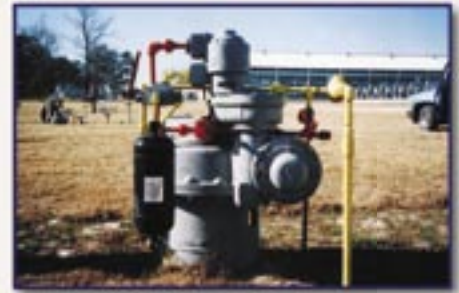
Gas Motor operated valve operator with vent mist extractor removes 99.8% all entrained liquids 6 microns and larger with one gallon liquid holding sump