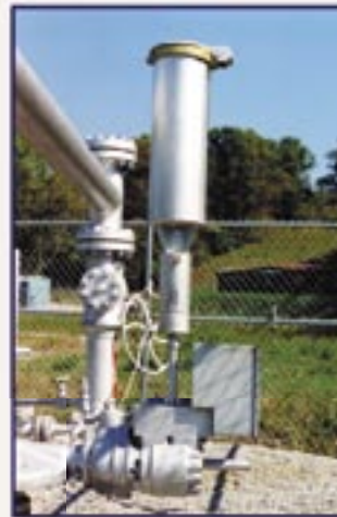
Gas Motor Operated Valve Operator With Vent Mist Extractor/Silencer Removes 99.8% All Entrained Liquids 6 Microns and Larger and Reduces Vent Noise to 85 Dba at 3 Ft.