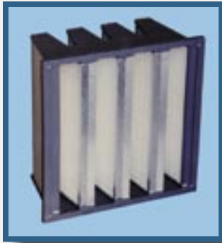
GTF-60, GTFX-60, GTF-90, GTFX-90 GTFX-95