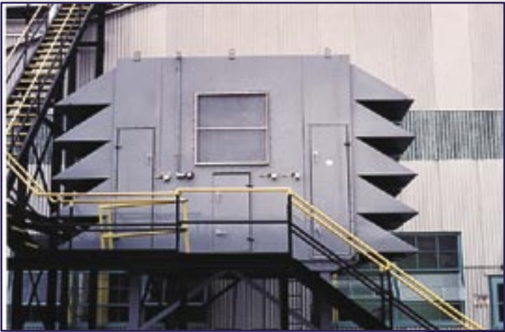
MED MODEL GTAF-50