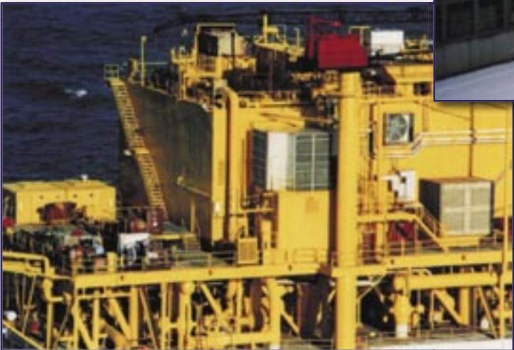
MED MODEL GTAF-72