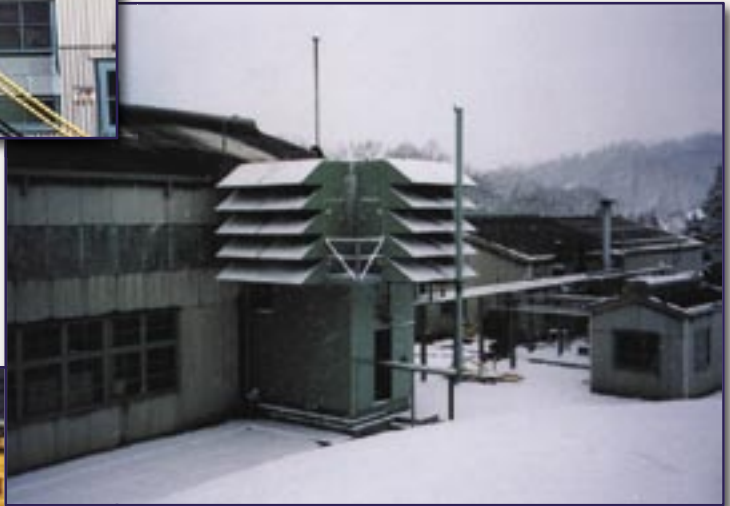
MED MODEL GTAF-75