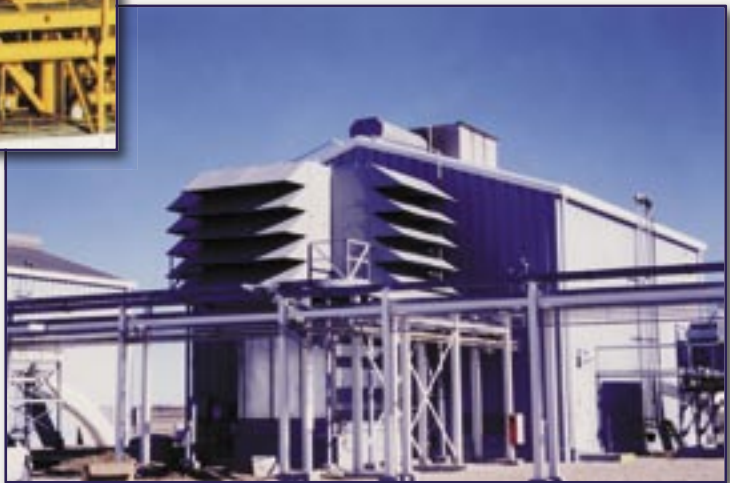
MED MODEL GTAF-75