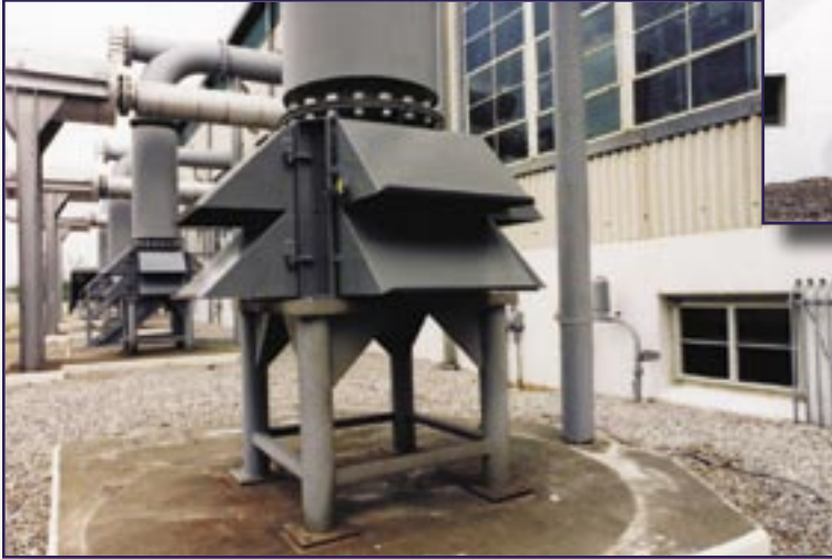
MED MODEL MAF-1-4E