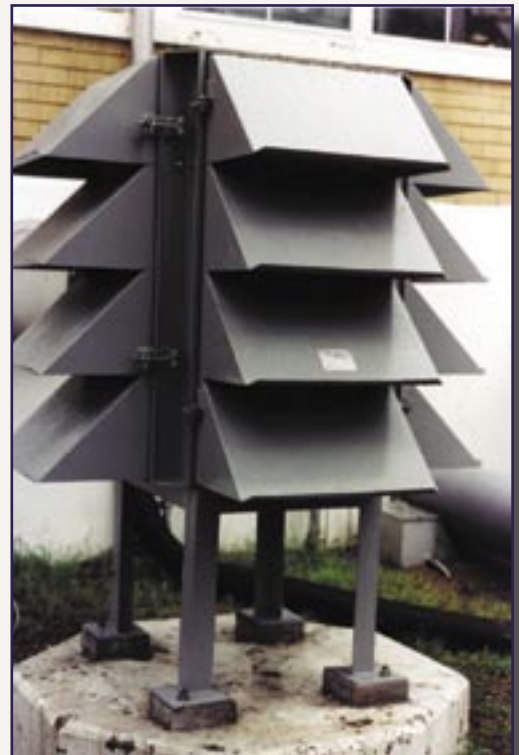
MED MODEL MAF-2-6-E1