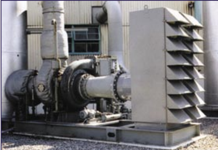
MED MODEL MAF-4-8D