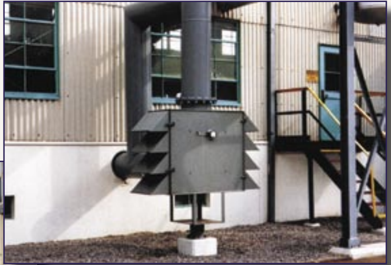
MED MODEL MAF-2-4D