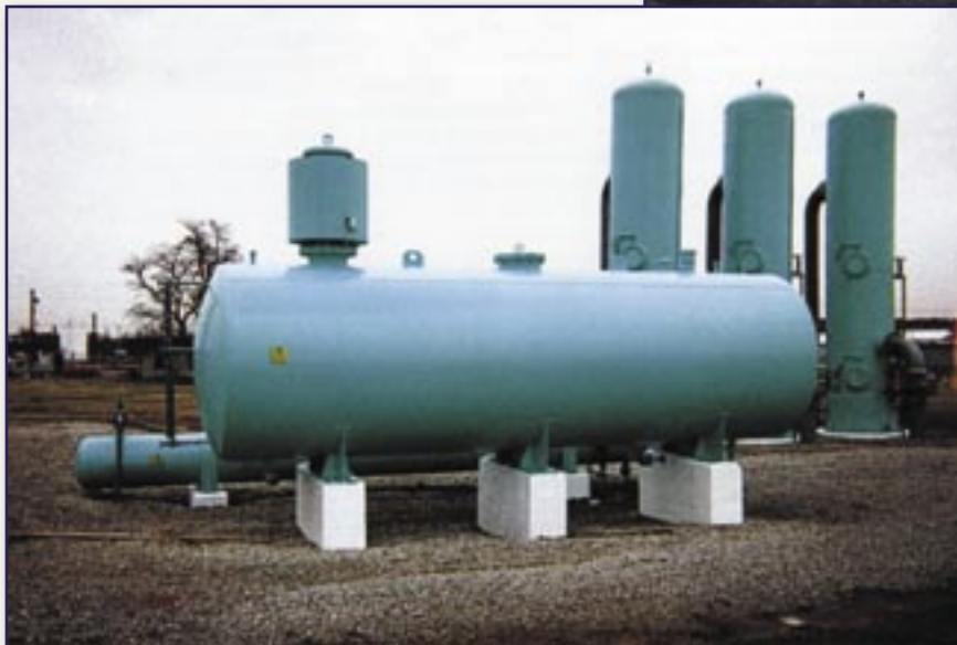
Compressor Packing Case and Dog House Vent