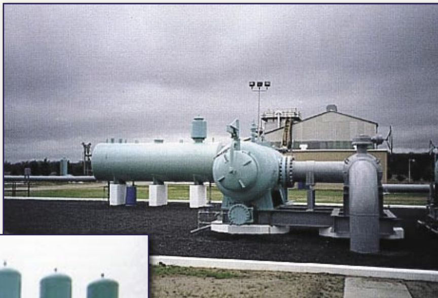
Suction Scrubber Sump Tank Vent